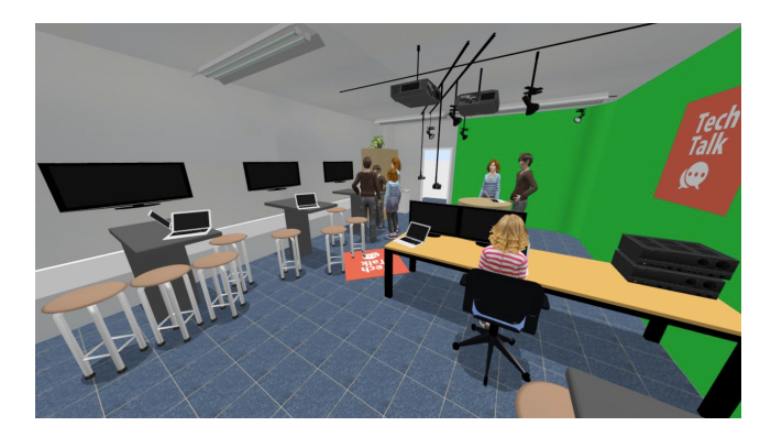
Figure 2: Conceptual sketch of the media studio.

To provide a better technical infrastructure and collaborative environment, we plan to build a small studio with the essential technical infrastructure and green screens that all students of our course can use. We are convinced that this will contribute to more