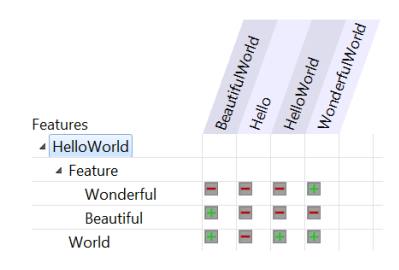
Figure 2: Configuration map for a Hello-World example from FeatureIDE.

For each challenge, we are interested in manually, semi-automatically, or fully-automatically derived solutions. It is important that all steps, problems, and results are well documented to ensure that they can be evaluated and compared to each other. This should also include reporting and discussing experiences and lessons learned for each solution. For all tools that are used, we ask that they are publicly available. However, these do not need to be tools specifically developed for software-product-line engineering. In addition, we ask that any created artifact, for example, feature models or